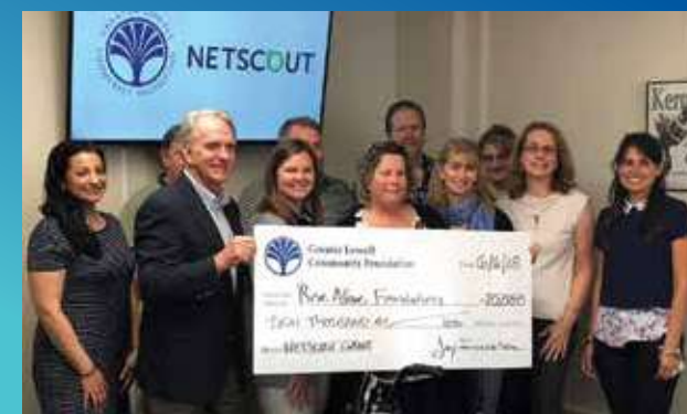
2018 Netscout Heart of Giving $10,000 grant recipient Rise Above Foundation