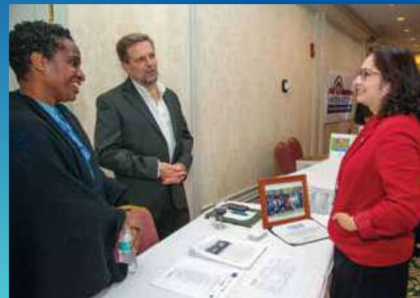
2018 Annual Meeting: GLCF invited past grant recipients and community partners, like Mill Cities Leadership Institute, to share their information.