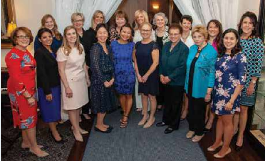
At the 15th anniversary of the Women Working Wonders (WWW) Fund, Planning Committee and Trustees gathered at Vesper Country Club where it was announced they had exceeded their fund goal of $1 million.

You can give now through a fund at the Foundation or give later through a planned gift or bequest. The Community Foundation has the expertise and the resources to accept even the most complicated gifts.