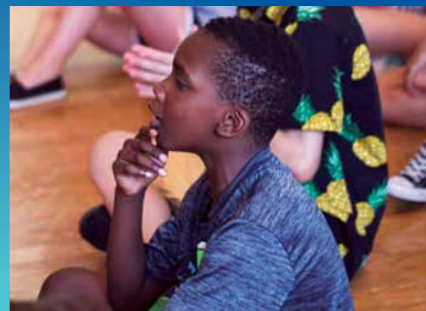
A member of MRT's Young Company, a GLCF grant supported program