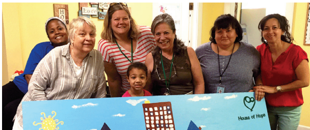
House of Hope received a 2019 Help Alleviate Hunger and Homelessness in Massachusetts grant