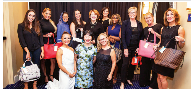
The WWW's signature fundraising event, Power of the Purse