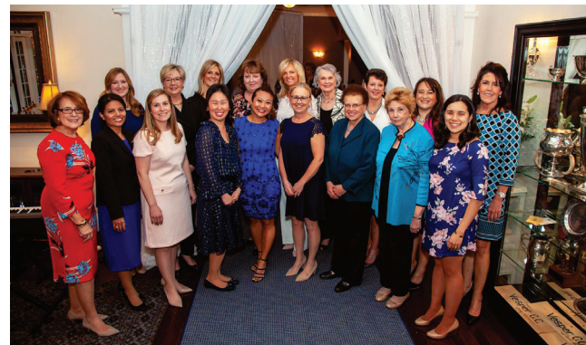
WWW Planning Committee and Trustees at the 15th Anniversary Celebration

For more information on the Women Working Wonders Fund, visit womenworkingwondersfund.com .